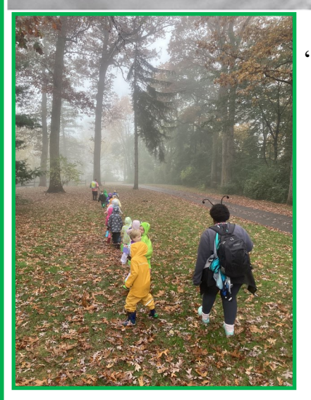
"Everyone must take time to sit and watch the leaves turn." -Elizabeth Lawrence